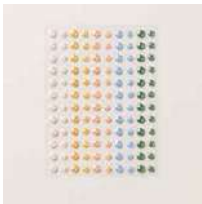
2026–2028 In Color™