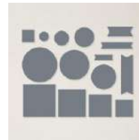
Stylish Shapes Dies