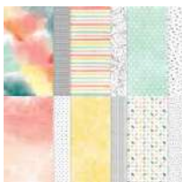
Beautiful Ordinary Life