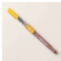
Golden Glow Shimmer