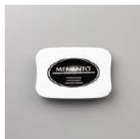
Tuxedo Black Memento