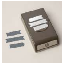
Three Banner Punch