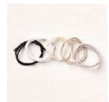
Baker's Twine Essentials