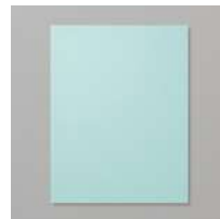
Pool Party 8-1/2" X 11"