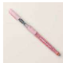
Barely Blush Shimmer