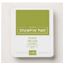
Old Olive Classic Stampin' Pad [147090]