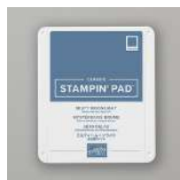
Misty Moonlight Classic Stampin' Pad [153118]