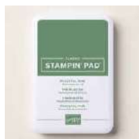
Peaceful Pine Classic Stampin Pad [167679]