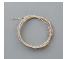
Linen Thread [104199]