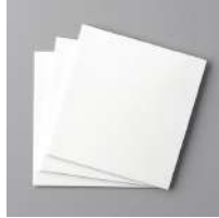
Foam Adhesive Sheets [152815]