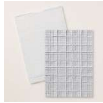
Forever Plaid 3 D Embossing Folder [164049]