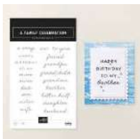
A Family Celebration Photopolymer Stamp Set (English) [167790]