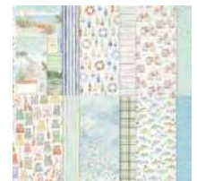
Waterside Retreat 12" X 12" (30.5 X 30.5 Cm) Designer Series Paper [167920]