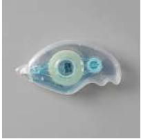
Stampin' Seal [152813]