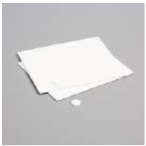
Stampin' Dimensionals [104430]