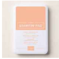
Crisp Cantaloupe Classic Stampin Pad [167680]