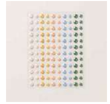
2026-2028 In Color™ Dots [167546]