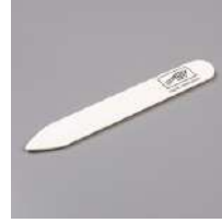
Bone Folder [102300]