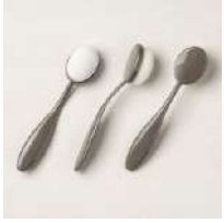
Blending Brushes [153611]