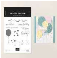
Balloon Festoon Photopolymer Stamp Set (English) [167602]