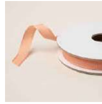
Crisp Cantaloupe 3/8" (1 Cm) Bordered Ribbon [167552]