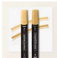
Golden Glow Stampin' Blends Combo Pack [167682]