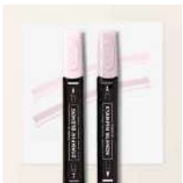
Barely Blush Stampin' Blends Combo Pack [167667]