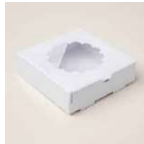
Scalloped Window Boxes [167655]