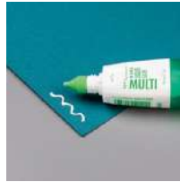
Multipurpose Liquid Glue [110755]