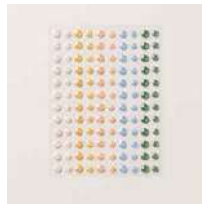
2026-2028 In Color™ Dots [167546]