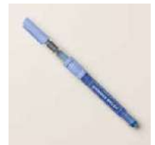
Hydrangea Hue Shimmer Brush [167663]