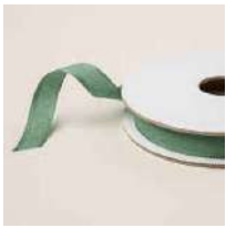
Peaceful Pine 3/8" (1 Cm) Bordered Ribbon [167551]