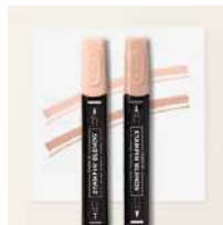
Crisp Cantaloupe Stampin' Blends Combo Pack [167669]