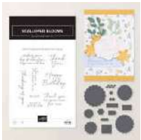
Scalloped Blooms Bundle (English) [167647]