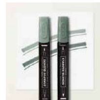
Peaceful Pine Stampin' Blends Combo Pack [167668]