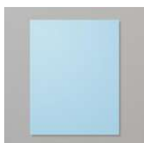
Balmy Blue 8-1/2" X 11" Cardstock [146982]