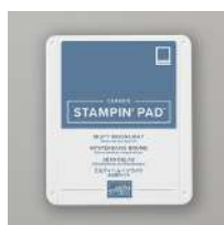
Misty Moonlight Classic Stampin' Pad [153118]