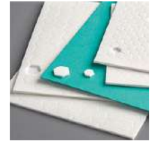
Mini Stampin' Dimensionals [144108]