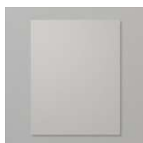
Gray Granite 8-1/2" X 11" Cardstock [146983]