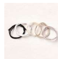
Baker's Twine Essentials Pack [155475]