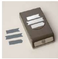
Three Banner Punch [167050]