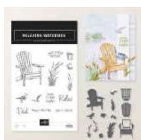
Relaxing Waterside Bundle (English) [167928]