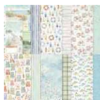
Waterside Retreat 12" X 12" (30.5 X 30.5 Cm) Designer Series Paper [167920]