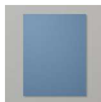
Misty Moonlight 8-1/2" X 11" Cardstock [153081]