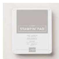
Gray Granite Classic Stampin' Pad [147118]