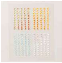
Sunset Sparkle Sequins [167785]