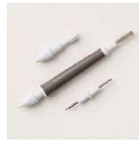
Take Your Pick [144107]