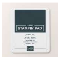
Secret Sea Classic Stampin' Pad [165285]