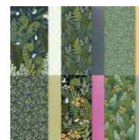
Moonlit Flora 12" X 12" (30.5 X 30.5 Cm) Designer Series Paper [167737]