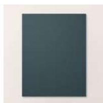
Secret Sea 8 1/2" X 11" Cardstock [165624]