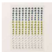
Dewdrops Embellishments [167748]