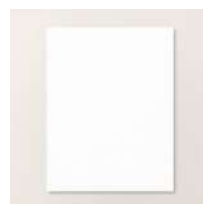
Basic White 8 1/2" X 11" Cardstock [166780]