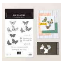
All Aflutter Bundle (English) [167570]