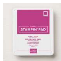
Berry Burst Classic Stampin' Pad [147143]