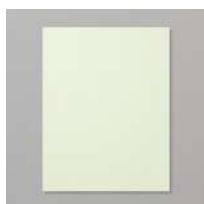
Soft Sea Foam 8-1/2" X 11" Cardstock [146988]