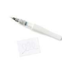
Clear Wink Of Stella Glitter Brush [141897]