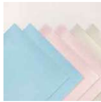
Sunset Shimmer Vellum 12" X 12" (30.5 X 30.5 Cm) Specialty Paper [167784]