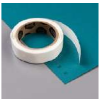
Mini Glue Dots [103683]