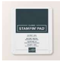
Secret Sea Classic Stampin' Pad [165285]