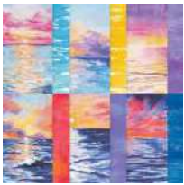
Scenic Coast 6" X 6" (15.2 X 15.2 Cm) Specialty Designer Series Paper [167773]