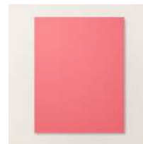
Strawberry Slush 8 1/2"