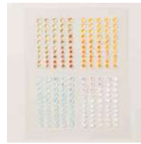
Sunset Sparkle Sequins [167785]