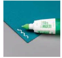
Multipurpose Liquid Glue [110755]