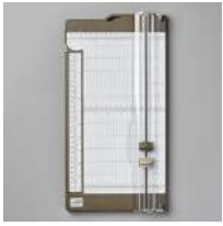
Paper Trimmer [152392]