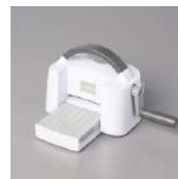
Mini Stampin' Cut & Emboss Machine [150673]