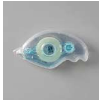
Stampin' Seal [152813]