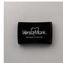
VersaMark Pad [102283]