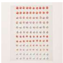
Pearlized Faceted Circles [166978]