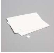
Stampin' Dimensionals [104430]