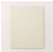
Basic Beige 8 1/2" X 11"