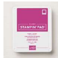
Berry Burst Classic