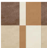
Wood Grain Wonders 12" X 12" (30.5 X 30.5 Cm) Designer Series Paper [167428]