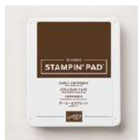
Early Espresso Classic Stampin' Pad [147114]