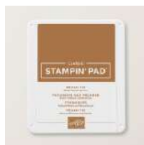
Pecan Pie Classic Stampin' Pad [161665]