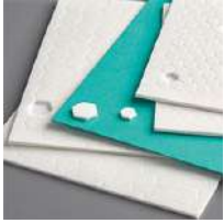
Mini Stampin' Dimensionals [144108]