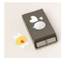
Bee Builder Punch [162553]