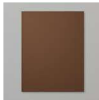
Early Espresso 8-1/2" X 11" Cardstock [119686]