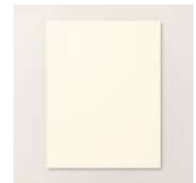
Very Vanilla 8 1/2" X 11" Cardstock [166784]