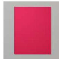
Real Red 8-1/2" X 11" Cardstock [102482]