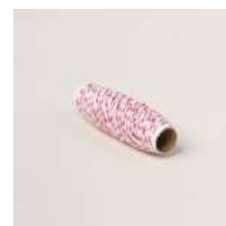
Real Red & White Baker's Twine [164051]