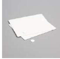
Stampin' Dimensionals [104430]