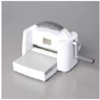
Stampin' Cut & Emboss Machine [149653]