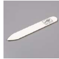
Bone Folder [102300]