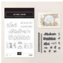
Cutest Crew Bundle (English) [167149]