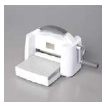
Stampin' Cut & Emboss Machine [149653]