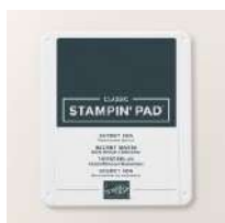
Secret Sea Classic Stampin' Pad [165285]