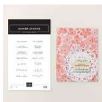
Banner Sayings Photopolymer Stamp Set (English) [167044]