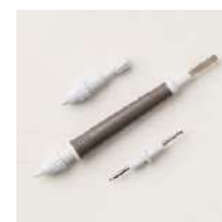
Take Your Pick [144107]