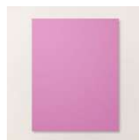
Petunia Pop 8 1/2" X 11" Cardstock [163801]