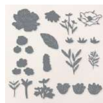
Pretty Florals Dies [165178]