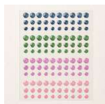
Sparkle Dot Essentials [166991]