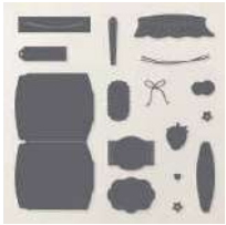
Filled With Sweetness Dies [167474]