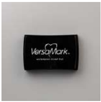
VersaMark Pad [102283]