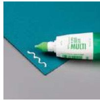
Multipurpose Liquid Glue [110755]