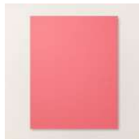
Strawberry Slush 8 1/2" X 11" Cardstock [165625]