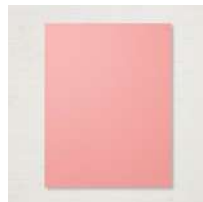
Flirty Flamingo 8-1/2" X 11" Cardstock [141416]