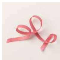
Strawberry Slush 3/8" (1 Cm) Faux Linen Ribbon [165274]