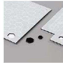
Black Stampin' Dimensionals Combo Pack [150893]