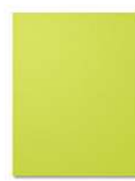
Lemon Lime Twist 8- 1/2" X 11" Cardstock [144245]