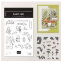
Sweet Bugs Bundle (English) [167002]