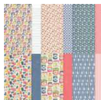
Homemade Sweetness 12" X 12" (30.5 X 30.5 Cm) Designer Series Paper [167467]