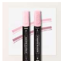
Pretty In Pink Stampin' Blends Combo Pack [163824]