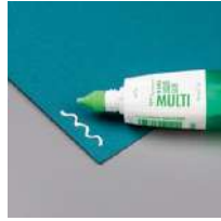
Multipurpose Liquid Glue [110755]