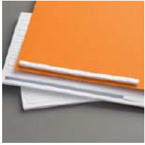
Foam Adhesive Strips [141825]