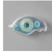
Stampin' Seal [152813]