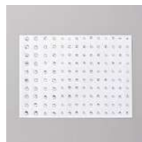
Rhinstone Basic Jewels [144220]