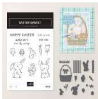
Easter Basket Bundle (English) [166947]