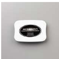
Tuxedo Black Memento Ink Pad [132708]