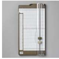
Paper Trimmer [152392]