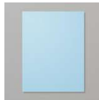
Balmy Blue 8-1/2" X 11" Cardstock [146982]