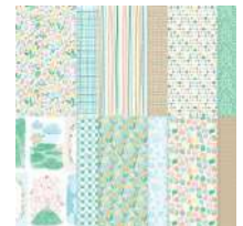
Easter Joy 12" X 12" (30.5 X 30.5 Cm) Specialty Designer Series Paper [166939]