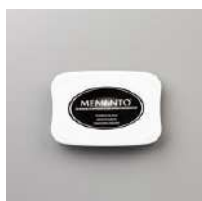
Tuxedo Black Memento Ink Pad [132708]