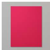
Real Red 8-1/2" X 11" Cardstock [102482]