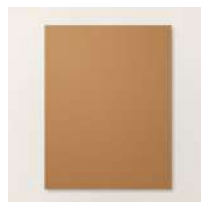
Pecan Pie 8 1/2" X 11" Cardstock [161717]