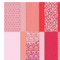
Made With Love 12" X 12" (30.5 X 30.5 Cm) Designer Series Paper [167054]