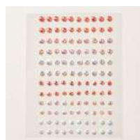
Pearlized Faceted Circles [166978]