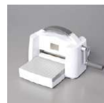
Stampin' Cut & Emboss Machine [149653]