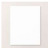
Basic White 8 1/2" X 11" Cardstock [166780]