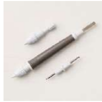
Take Your Pick