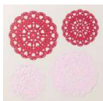
Lovely Doilies [167104]