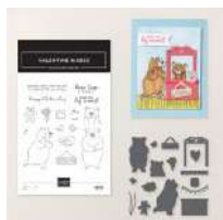
Valentine Kisses Bundle (English) [167310]