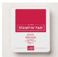
Real Red Classic Stampin' Pad [147084]