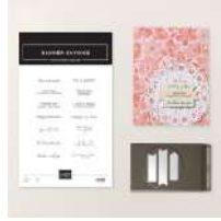
Banner Sayings Bundle (English) [167051]