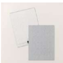
Beautiful Pattern 3 D Embossing Folder [167097]