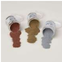
Metallics Wow! Embossing Powder [165678]