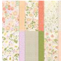
Lovely & Beautiful 12" X 12" (30.5 X 30.5 Cm) Specialty Designer Series Paper [166957]