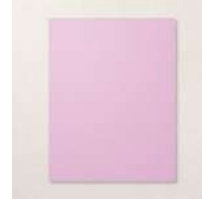
Fresh Freesia 8 1/2" X 11" Cardstock [155613]