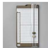
Paper Trimmer [152392]