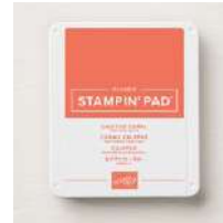
Calypso Coral Classic Stampin' Pad [147101]