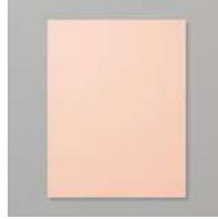
Petal Pink 8-1/2" X 11" Cardstock [146985]