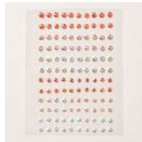
Pearlized Faceted Circles [166978]