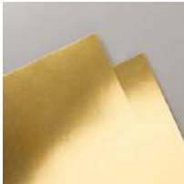
Gold Foil Sheets [132622]