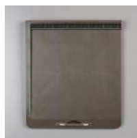
Simply Scored [122334]