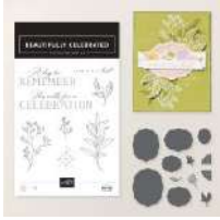
Beautifully Celebrated Bundle (English) [166975]