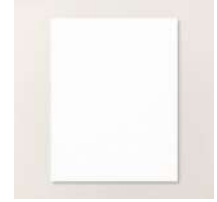
Basic White 8 1/2" X 11" Cardstock [166780]