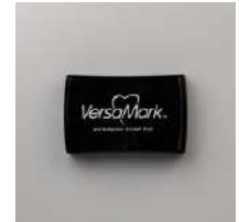
Versamark Pad [102283]