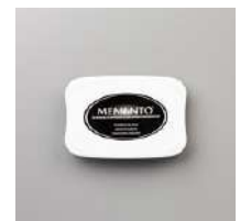
Tuxedo Black Memento Ink Pad [132708]