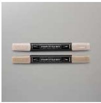
Crumb Cake Stampin' Blends Combo Pack [154882]