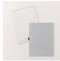
Beautiful Pattern 3 D Embossing Folder [167097]