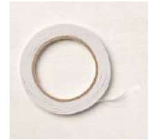
Tear & Tape Adhesive [154031]