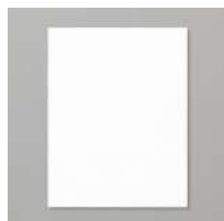
Basic White 8 1/2" X 11" Thick Cardstock [159229]