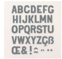
Party Alphabet Dies [165263]