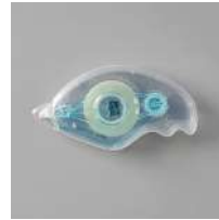
Stampin' Seal [152813]