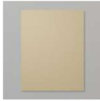
Crumb Cake 8-1/2" X