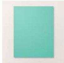
Summer Splash 8 1/2" X