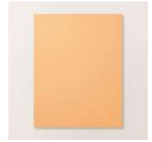
Peach Pie 8 1/2" X 11"