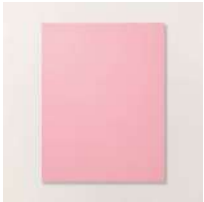
Pretty In Pink 8 1/2" X