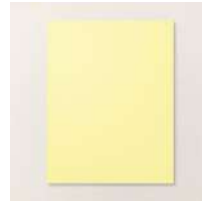
Lemon Lolly 8 1/2" X