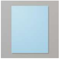
Balmy Blue 8-1/2" X 11"