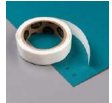
Mini Glue Dots