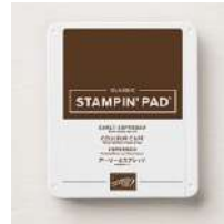
Early Espresso Classic