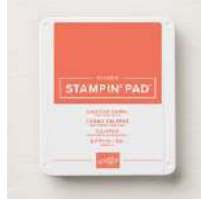
Calypso Coral Classic Stampin' Pad [147101]