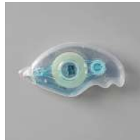
Stampin' Seal [152813]