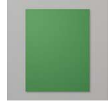
Garden Green 8-1/2" X 11" Cardstock [102584]