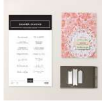
Banner Sayings Bundle (English) [167051]