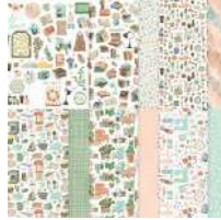
Hobby Haven 12" X 12" (30.5 X 30.5 Cm) Specialty Designer Series Paper [167201]