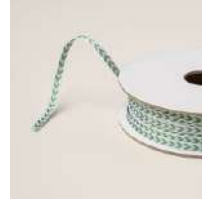
Garden Green 1/8" (3.2 Mm) Chevron Ribbon [167212]