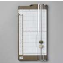
Paper Trimmer [152392]