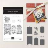
Creative Haven Bundle (English) [167209]