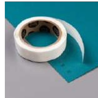
Mini Glue Dots [103683]