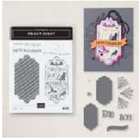
Fright Night Bundle (English) [166107]