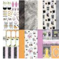
Spooky Sweet 12" X 12" (30.5 X 30.5 Cm) Specialty Designer Series Paper [166191]