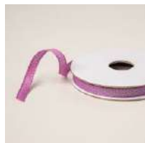
Petunia Pop 1/4" (6.4 Mm) Iridescent Ribbon [166203]