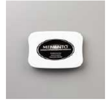
Tuxedo Black Memento Ink Pad [132708]