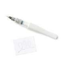
Clear Wink Of Stella Glitter Brush [141897]