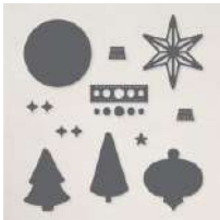
Ornamental Christmas Dies [166000]