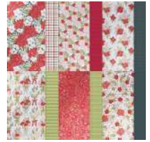
Traditions Of Christmas 12" X 12" (30.5 X 30.5 Cm) Specialty Designer Series Paper [165853]