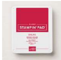
Real Red Classic Stampin' Pad [147084]