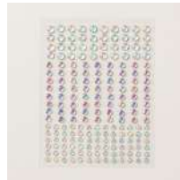
Holographic Resin Dots [165598]