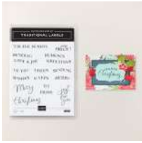
Traditional Labels Photopolymer Stamp Set (English) [165854]