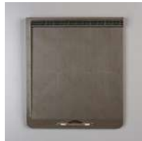
Simply Scored [122334]