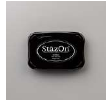
Jet Black StazOn Ink Pad [101406]