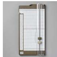
Paper Trimmer [152392]