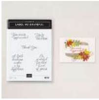
Label Me Grateful Cling Stamp Set (English) [166108]