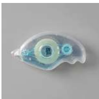
Stampin' Seal [152813]