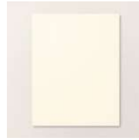
Very Vanilla 8 1/2" X 11" Cardstock [166784]