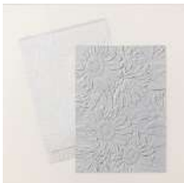
Sunflower 3 D Embossing Folder [166145]