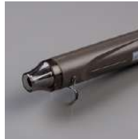
Heat Tool (Us And Canada) [129053]