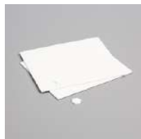
Stampin' Dimensionals [104430]