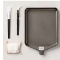
Embossing Additions Tool Kit [159971]