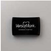
VersaMark Pad [102283]