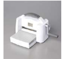
Stampin' Cut & Emboss Machine [149653]