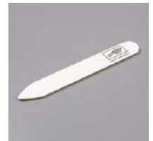
Bone Folder [102300]