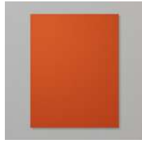
Cajun Craze 8-1/2" X 11" Cardstock [119684]