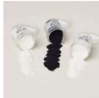
Basics Wow! Embossing Powder [165679]