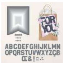
Party Dies Bundle