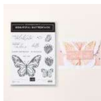
Beautiful Butterflies Photopolymer Stamp Set (English) [164608]