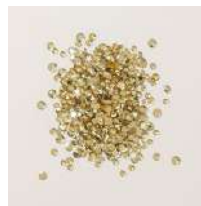
Loose Gold Sequins