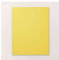
Darling Duckling 8 1/2"