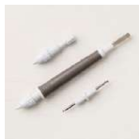
Take Your Pick