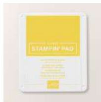
Darling Duckling Classic