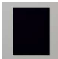
Basic Black 8-1/2" X 11" Cardstock [121045]