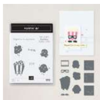
Poppin' By Bundle (English) [165489]