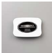
Tuxedo Black Memento