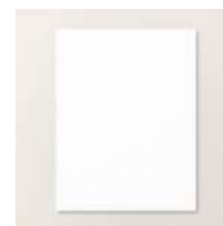
Basic White 8 1/2" X 11" Cardstock [166780]