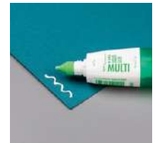
Multipurpose Liquid Glue [110755]