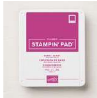
Berry Burst Classic Stampin' Pad [147143]