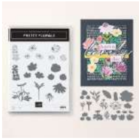
Pretty Florals Bundle [165179]