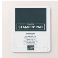
Secret Sea Classic Stampin' Pad [165285]