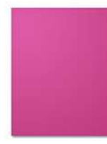
Berry Burst 8-1/2" X 11" Cardstock [144243]