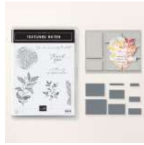
Textured Notes Bundle (English) [165556]