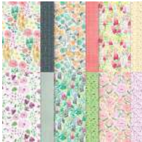
Florals In Bloom 12" X 12" (30.5 X 30.5 Cm) Designer Series Paper [165175]