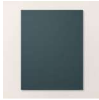
Secret Sea 8 1/2" X 11" Cardstock [165624]