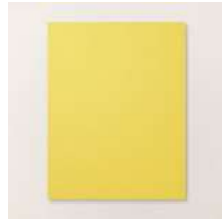
Darling Duckling 8 1/2" X 11" Cardstock [165622]