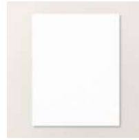
Basic White 8 1/2" X 11" Cardstock [166780]