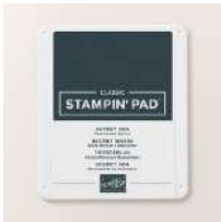
Secret Sea Classic Stampin' Pad [165285]