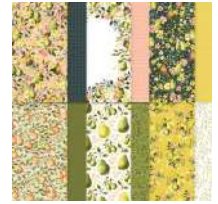
Painterly Pears 12" X 12" (30.5 X 30.5 Cm) Designer Series Paper [166146]