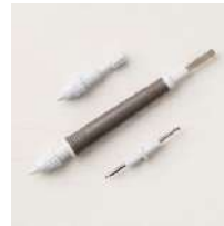
Take Your Pick [144107]