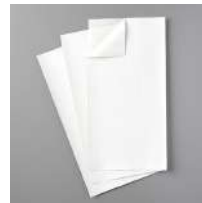
Adhesive Sheets [152334]