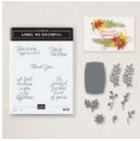
Label Me Grateful Bundle (English) [166112]