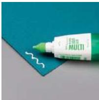
Multipurpose Liquid Glue [110755]