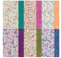
Floral Charm 12" X 12" (30.5 X 30.5 Cm) Designer Series Paper [166125]