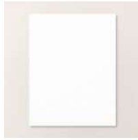
Basic White 8 1/2" X 11" Cardstock [166780]