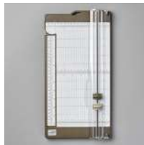
Paper Trimmer [152392]