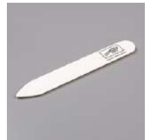
Bone Folder [102300]