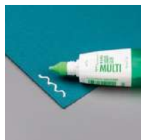
Multipurpose Liquid Glue [110755]