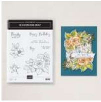
Charming Day Cling Stamp Set (English) [166126]