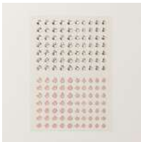
Low Profile Dots [164658]