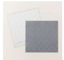
Damask Designs Embossing Folder [165214]