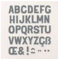
Party Alphabet Dies [165263]