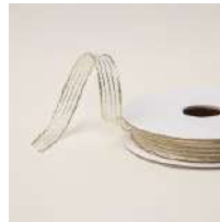
Gold Striped 3/8" (1 Cm) Mesh Ribbon [165599]