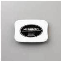
Tuxedo Black Memento Ink Pad [132708]