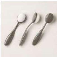
Blending Brushes [153611]