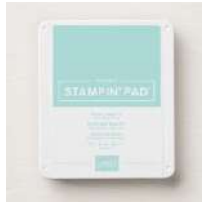
Pool Party Classic Stampin' Pad [147107]