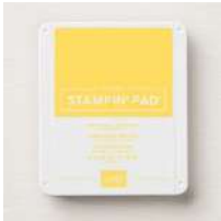
Daffodil Delight Classic Stampin' Pad [147094]