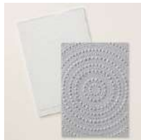
Dotted Circles 3 D Embossing Folder [163789]