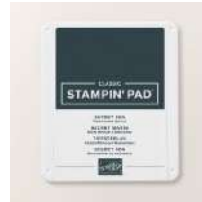
Secret Sea Classic Stampin' Pad [165285]