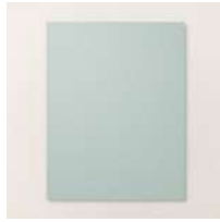
Cloud Cover 8 1/2" X 11" Cardstock [165621]