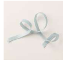
Cloud Cover 3/8" (1 Cm) Faux Linen Ribbon [165271]