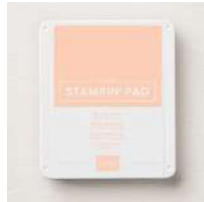
Petal Pink Classic Stampin' Pad [147108]