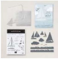
Sunrise Sailing Bundle (English) [165497]