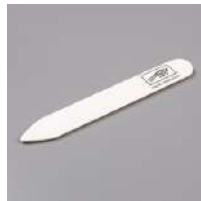
Bone Folder [102300]