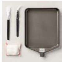
Embossing Additions Tool Kit [159971]