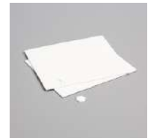
Stampin' Dimensionals [104430]