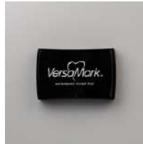
VersaMark Pad [102283]