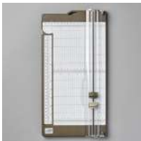
Paper Trimmer [152392]