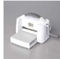
Stampin' Cut & Emboss Machine [149653]