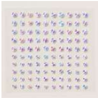
Iridescent Faceted Gems [163368]