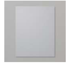
Smoky Slate 8-1/2" X 11" Cardstock [131202]