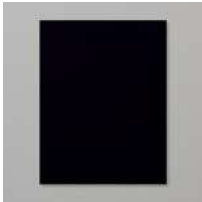
Basic Black 8-1/2" X 11" Cardstock [121045]