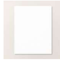
Basic White 8 1/2" X 11" Cardstock [166780]