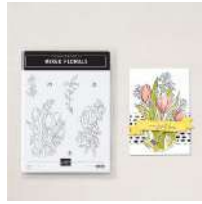
Mixed Florals Photopolymer Stamp Set [164639]