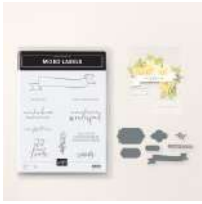
Mixed Labels Bundle (English) [164653]