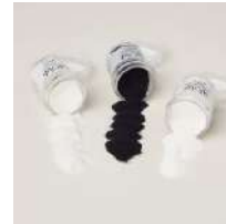
Basics Wow! Embossing Powder [165679]