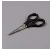
Paper Snips [103579]