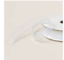
Iridescent 1/2" (1.3 Cm) Striped Trim [163299]