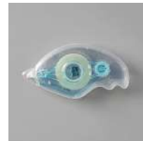
Stampin' Seal [152813]