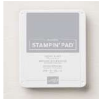
Smoky Slate Classic Stampin' Pad [147113]