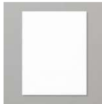
Basic White 8 1/2" X 11" Cardstock [159276]