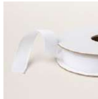
White 1/2" (1.3 Cm) Woven Ribbon [164634]