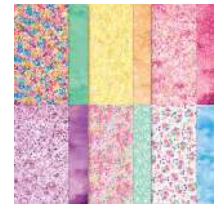
Bloom Impressions 12" X 12" (30.5 X 30.5 Cm) Designer Series Paper [164944]