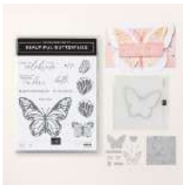
Beautiful Butterflies Bundle (English) [164615]