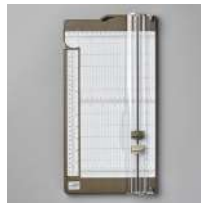
Paper Trimmer [152392]