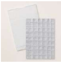
Forever Plaid 3 D Embossing Folder [164049]