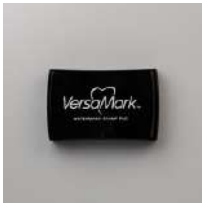
VersaMark Pad [102283]