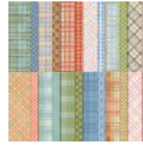
Timeless Plaid 6" X 6" (15.2 X 15.2 Cm) Designer Series Paper [I64678]