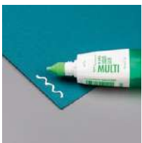
Multipurpose Liquid Glue [I10755]