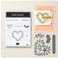
Heart Shaped Bundle (English) [I64953]