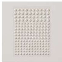
Antique Pearls [I64679]