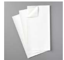
Adhesive Sheets [I52334]