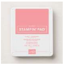
Flirty Flamingo Classic Stampin' Pad [I47052]