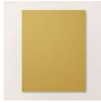
Wild Wheat 8 1/2" X 11" Cardstock [I61725]