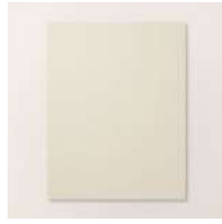
Basic Beige 8 1/2" X 11" Cardstock [I64511]