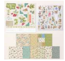
Storybook Moments 12" X 12" (30.5 X 30.5 Cm) Designer Series Paper & Sticker Sheet (English) [I66617]