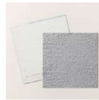
Exposed Brick 3 D Embossing Folder [I61600]