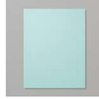
Pool Party 8-1/2" X 11" Cardstock [I22924]