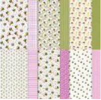
Cute As Can Bee 12" X 12" (30.5 X 30.5 Cm) Designer Series Paper [I66621]