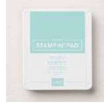
Pool Party Classic Stampin' Pad [I47107]