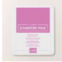
Petunia Pop Classic Stampin Pad [I63811]