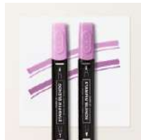
Petunia Pop Stampin' Blends Combo Pack [I63828]