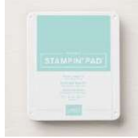
Pool Party Classic Stampin' Pad [I47107]