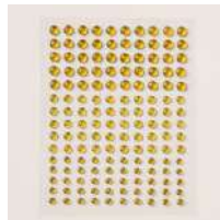
Gold Textured Adhesive Backed Dots [I64027]