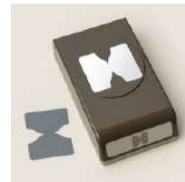
Keeping Tabs Punch [I63538]