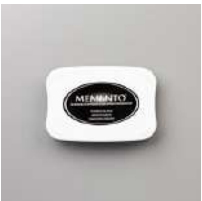
Tuxedo Black Memento Ink Pad [I32708]