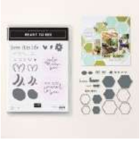
Meant To Bee Bundle (English) [I67243]