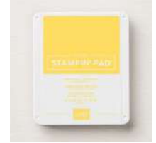
Daffodil Delight Classic Stampin' Pad [I47094]