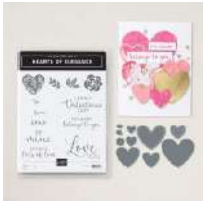
Hearts Of Elegance Bundle (English) [164916]