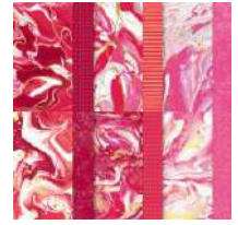
Marbled Elegance 12" X 12" (30.5 X 30.5 Cm) Specialty Designer Series Paper [164919]