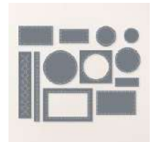
Everyday Details Dies [162864]