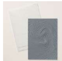
So Swirly Embossing Folder [163791]