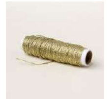
Gold Twisted Thread [164603]