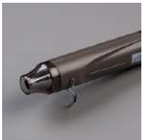
Heat Tool (Us And Canada) [129053]