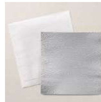
Timber 3 D Embossing Folder [163094]