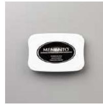
Tuxedo Black Memento Ink Pad [132708]