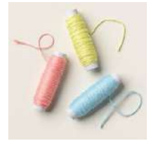
Baker's Twine Three Color Pack [162759]