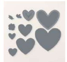
Hearts Of Elegance Dies [164915]