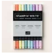
Subtles Stampin' Write Markers [161698]