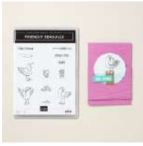
Friendly Seagulls Photopolymer Stamp Set (English) [164961]