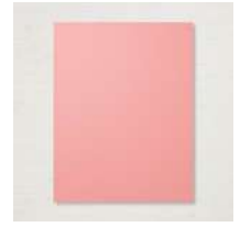
Flirty Flamingo 8-1/2" X 11" Cardstock [141416]