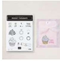
Pocket Thoughts Photopolymer Stamp Set (English) [163547]