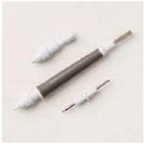
Take Your Pick