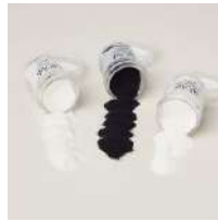
Basics Wow! Embossing Powder [165679]