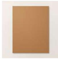
Pecan Pie 8 1/2" X 11" Cardstock [161717]