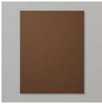
Early Espresso 8-1/2" X 11" Cardstock [119686]