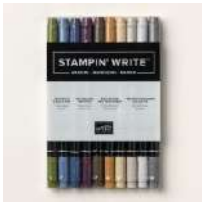
Neutrals Stampin' Write Markers [161697]