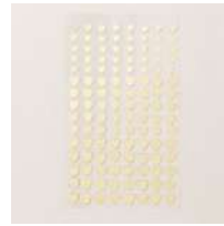
Adhesive Backed Heart Sequins [164920]