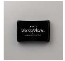
VersaMark Pad [102283]