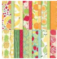
Fruit Salad 6" X 6" (15.2 X 15.2 Cm) Designer Series Paper [164943]