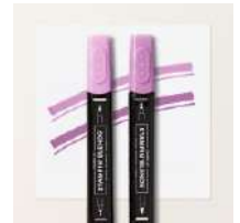
Petunia Pop Stampin' Blends Combo Pack [163828]