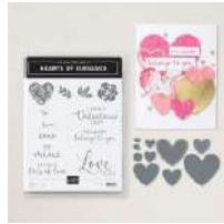
Hearts Of Elegance Bundle (English) [164916]