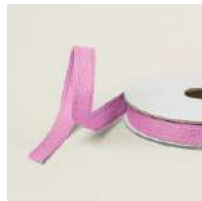
Petunia Pop 3/8" (1 Cm) Bordered Ribbon [163785]