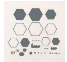
Meant To Bee Dies [166582]