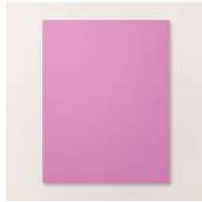
Petunia Pop 8 1/2" X 11" Cardstock [163801]