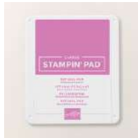
Petunia Pop Classic Stampin' Pad [163811]