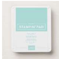
Pool Party Classic Stampin' Pad [147107]