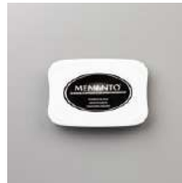
Tuxedo Black Memento Ink Pad [132708]