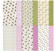
Cute As Can Bee 12" X 12" (30.5 X 30.5 Cm) Designer Series Paper [166621]