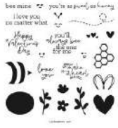
Bee My Valentine Photopolymer Stamp Set (English) [162547]