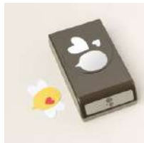
Bee Builder Punch [162553]