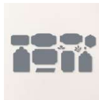
Something Fancy Dies [160424]