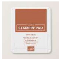
Copper Clay Classic Stampin' Pad [161647]