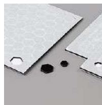
Black Stampin' Dimensionals Combo Pack [150893]