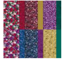
Regal Winter 12" X 12" (30.5 X 30.5 Cm) Designer Series Paper [164156]