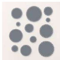
Spotlight On Nature Dies [163580]