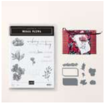
Regal Flora Bundle (English) [164034]