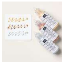
Metallic Enamel Effects Basics [161610]