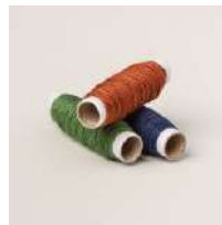
Natural Tones Linen Thread [164071]