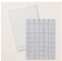
Forever Plaid 3 D Embossing Folder [164049]