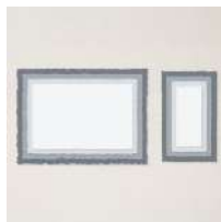
Deckled Rectangles Dies [159173]