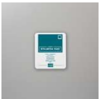
Pretty Peacock Classic Stampin' Pad [150083]