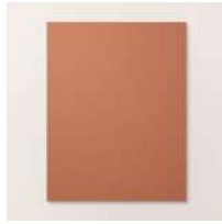
Copper Clay 8 1/2" X 11" Cardstock [161721]