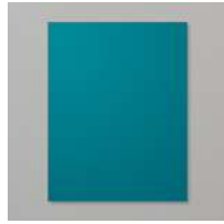
Pretty Peacock 8-1/2" X 11" Cardstock [150880]