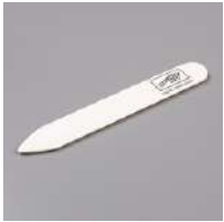
Bone Folder [102300]