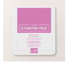
Petunia Pop Classic Stampin Pad [163811]