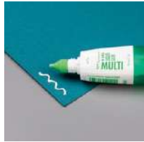
Multipurpose Liquid Glue [110755]