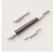
Take Your Pick [144107]