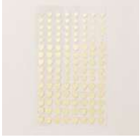
Adhesive Backed Heart Sequins [164920]