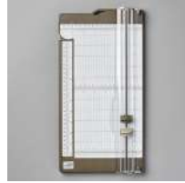
Paper Trimmer [152392]