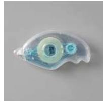
Stampin' Seal [152813]