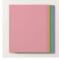
2024-2026 In Color™ 8 1/2" X 11" Cardstock [163803]