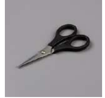
Paper Snips [103579]