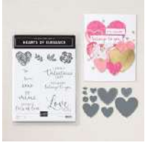
Hearts of Elegance Bundle (English) [164916]