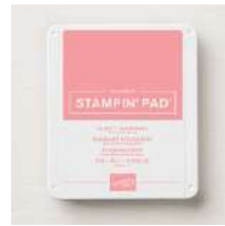
Flirty Flamingo Classic Stampin' Pad [147052]