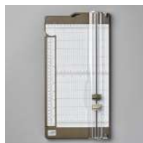
Paper Trimmer [152392]