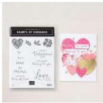
Hearts of Elegance Photopolymer Stamp Set (English) [164909]