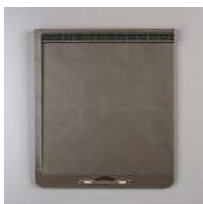
Simply Scored [122334]