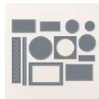
Everyday Details Dies [162864]