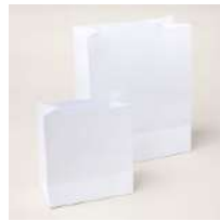
Gift Bags Combo Pack [164922]