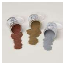
Metallics Wow! Embossing Powder [165678]