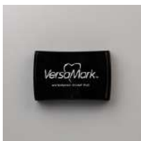
Versamark Pad [102283]