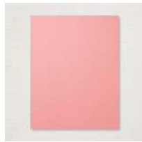
Flirty Flamingo 8-1/2" X 11" Cardstock [141416]