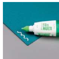
Multipurpose Liquid Glue [110755]