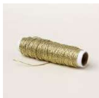
Gold Twisted Thread [164603]