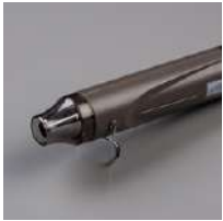
Heat Tool (Us And Canada) [129053]