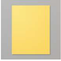
Daffodil Delight 8-1/2\" X 11\" Cardstock [119683]