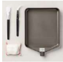
Embossing Additions Tool Kit [159971]