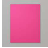
Melon Mambo 8-1/2\" X 11\" Cardstock [115320]