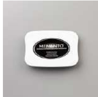
Tuxedo Black Memento Ink Pad [132708]