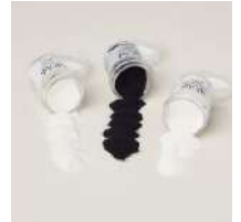
Basics Wow! Embossing Powder [165679]