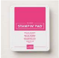
Melon Mambo Classic Stampin' Pad [147051]