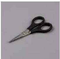
Paper Snips [103579]