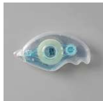
Stampin' Seal [152813]