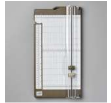
Paper Trimmer [152392]