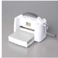
Stampin' Cut & Emboss Machine [149653]