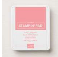
Flirty Flamingo Classic Stampin' Pad [147052]