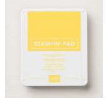
Daffodil Delight Classic Stampin' Pad [147094]