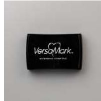
VersaMark Pad [102283]