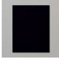
Basic Black 8-1/2\" X 11\" Cardstock [121045]