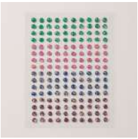
Regal Foiled Adhesive Backed Dots [164038]