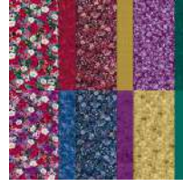
Regal Winter 12" X 12" (30.5 X 30.5 Cm) Designer Series Paper [164156]