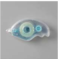
Stampin' Seal [152813]