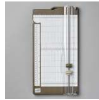
Paper Trimmer [152392]