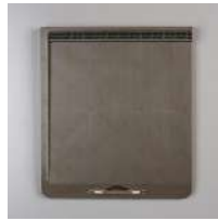
Simply Scored [122334]