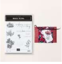
Regal Flora Cling Stamp Set (English) [164157]