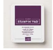
Blackberry Bliss Classic Stampin' Pad [147092]